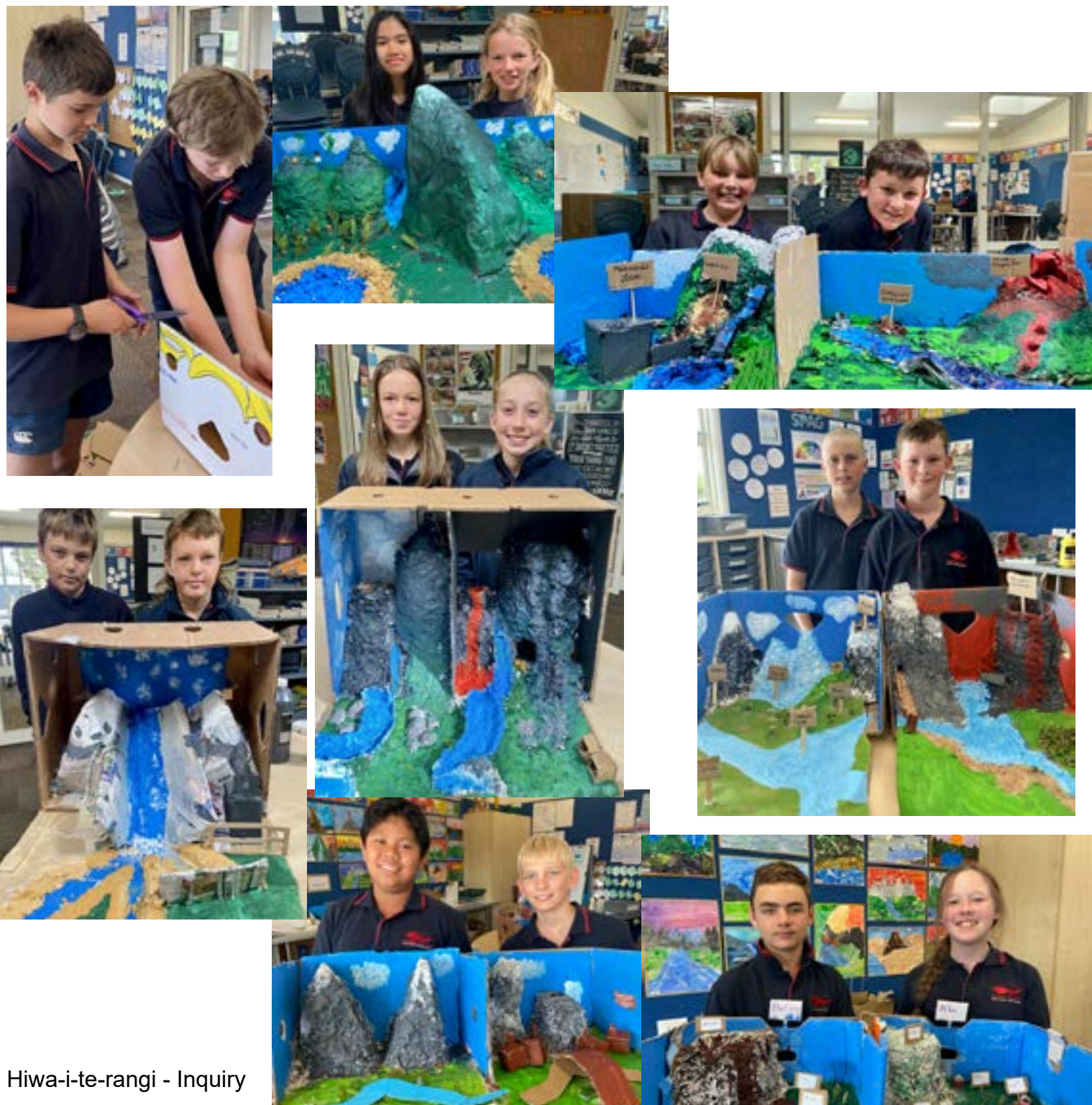
Hiwa-i-te-rangi - Inquiry

In inquiry this term we have been learning about natural landscapes and how they change over time. They can change naturally or because of urban development, erosion or chemical change. We used our newfound knowledge to make before and after dioramas, to show the impact of humans and natural processes on natural landscapes.