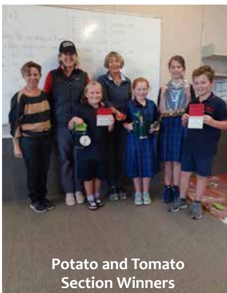
Potato and Tomato Section Winners

I wonder if the twig will follow the river safely as it snakes all the way to the sea.