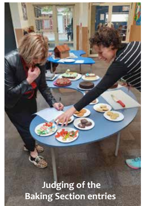
Judging of the Baking Section entries

This is my favourite place full of hustle and bustle, busyness and the people I love.